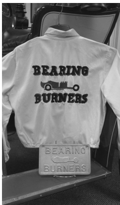
Bearing Burners Jacket and Plaque