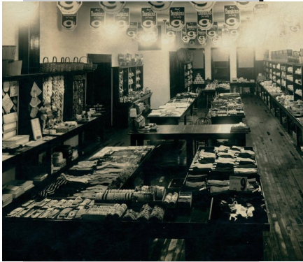
Interior of the Star Clothing Store

Don't forget to watch for our V.I.P.s of Syracuse "Wax Museum" community event this spring, put on by Wawasee School High-Ability Students!