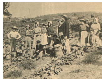
Syracuse Pickle Pickers, 1904

Did you know that Syracuse once had a pickle salting station? The Union Canning Company had a plant here at the start of the 20th century. Over 100 acres of pickles were planted each season around Syracuse. Farmers received 60 cents per 50-lb bushel, providing