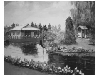
Chinese Gardens, Lake Wawasee

We thank you for your continued support of the Museum—you are instrumental to our mission of preserving local artifacts and providing historical programming to the Syracuse and Wawasee communities.