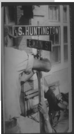
Street Sign Huntington and Main Streets