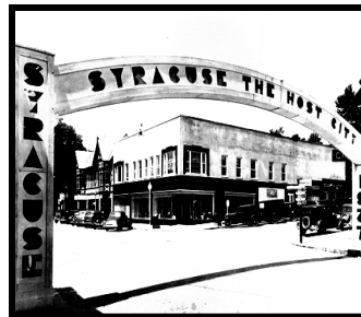
Pickwick Block, Syracuse, IN, 1937

racuse/Wawasee area and how this community holds a special place in their own family histories. Truly it is a small world.