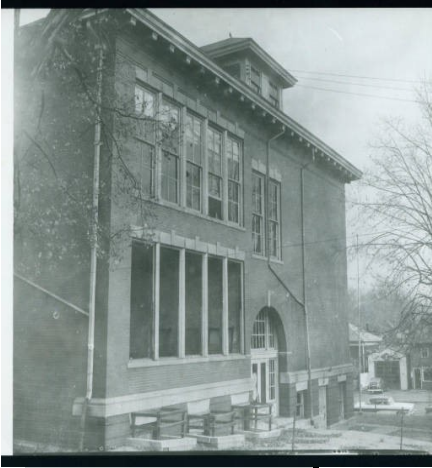
Syracuse Grade School at time of demolition 1956

Nothing that was worthy in the past departs; no truth or goodness realized by man ever dies, or can die.