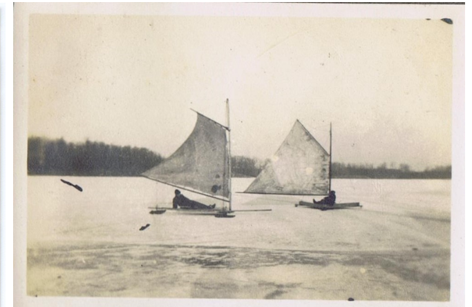
Iceboats, December 1918