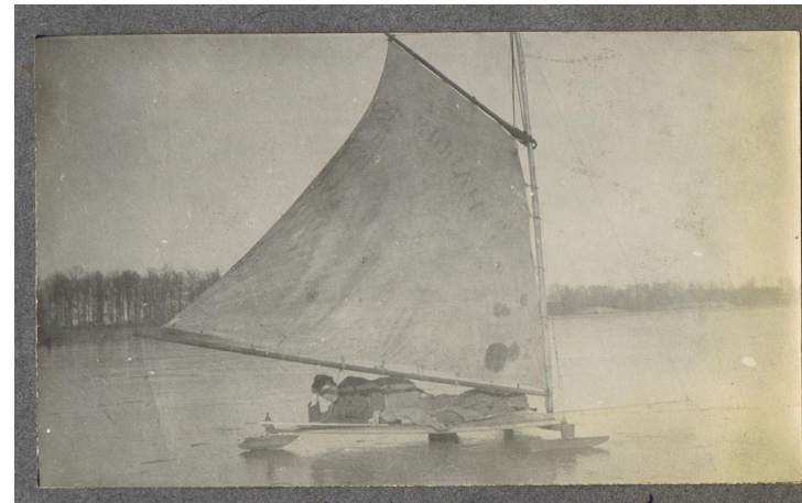
"The Kangaroo" iceboat, December 1918