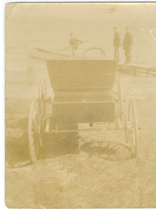
Possible picture of the prototype of the Mier car that Sheldon Harkless built.