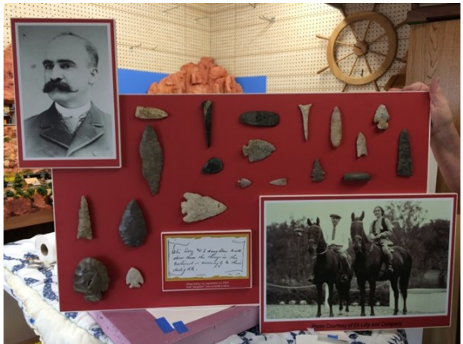
A partial panel for the new display